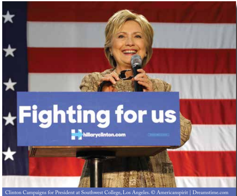
Clinton Campaigns for President at Southwest College, Los Angeles.

As Secretary of State, Clinton was a vocal champion of comprehensive efforts to raise the status of women and expand reproductive healthcare, including safe abortion. She created the State Department Office of Global Women’s Issues to elevate the needs of women to the top levels of American diplomacy. She worked tirelessly to call attention to and end the use of rape as a weapon of war.