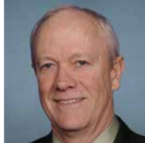
REP. JERRY MCNERNEY (D-CA/9)