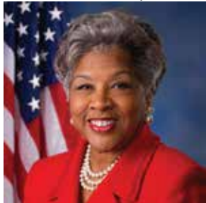
REP. JOYCE BEATTY (D-OH/3)