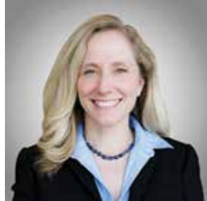
ABIGAIL SPANBERGER (D-VA/7)