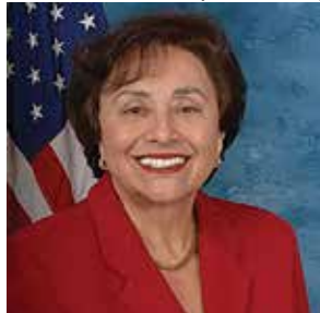
REP. NITA LOWEY (D-NY/17)