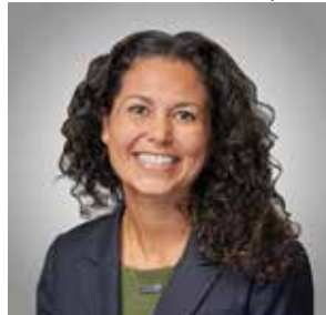
XOCHITL TORRES SMALL (D-NM/2)