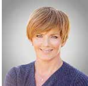
SUSIE LEE (D-NV/3)