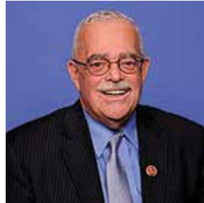
REP. GERRY CONNOLLY (D-VA/11)