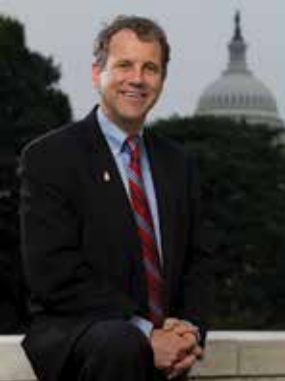
SEN. SHERROD BROWN (D-OH)