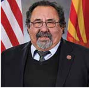
REP. RAUL GRIJALVA (D-AZ/3)