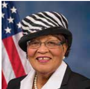
REP. ALMA ADAMS (D-NC/12)