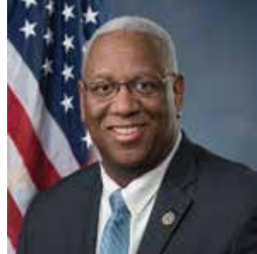
REP. DON MCEACHIN (D-VA/4)