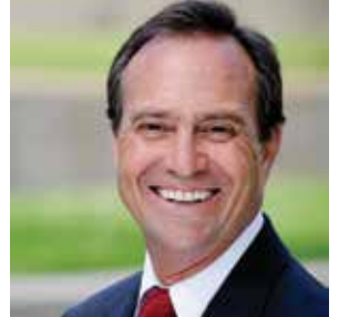
REP. ED PERLMUTTER (D-CO/7)