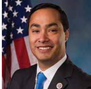
REP. JOAQUIN CASTRO (D-TX/20)