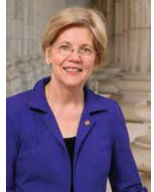
SEN. ELIZABETH WARREN (D-MA)