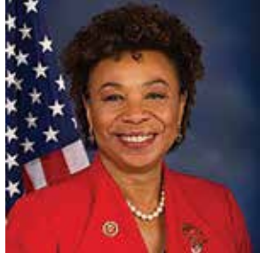
REP. BARBARA LEE (D-CA/13)