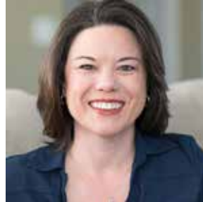
ANGIE CRAIG (D-MN/2)