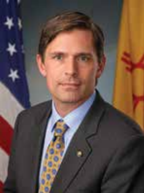
SEN. MARTIN HEINRICH (D-NM)