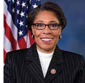
REP. MARCIA FUDGE (D-OH/11)