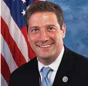
REP. TIM RYAN (D-OH/13)