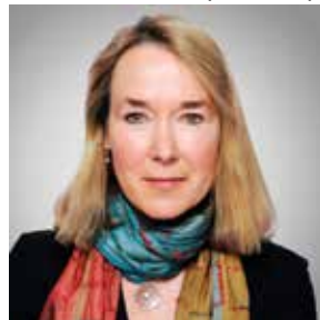
LESLIE COCKBURN (D-VA/5)