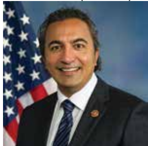
REP. AMI BERA (D-CA/7)