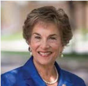
REP. JAN SCHAKOWSKY (D-IL/9)