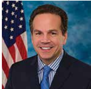
REP. DAVID CICILLINE (D-RI/1)