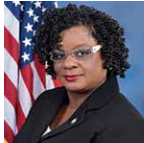
REP. GWEN MOORE (D-WI/4)