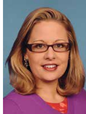
REP. KYRSTEN SINEMA (D-AZ)