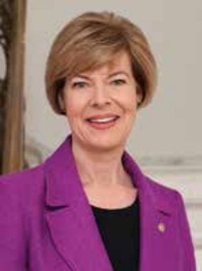
SEN. TAMMY BALDWIN (D-WI)