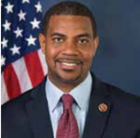
STEVEN HORSFORD (D-NV/4)