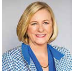
NANCY SODERBERG (D-FL/6)