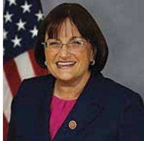
REP. ANN KUSTER (D-NH/2)