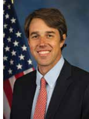
REP. BETO O'ROURKE (D-TX)