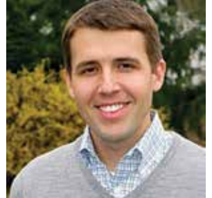
CHRIS PAPPAS (D-NH/1)