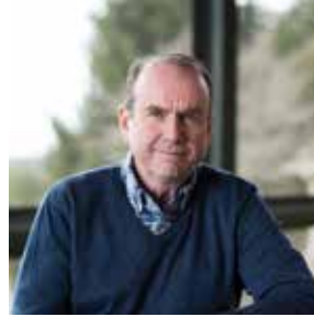
SCOTT WALLACE (D-PA/1)