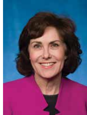
REP. JACKY ROSEN (D-NV)