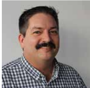
RANDY BRYCE (D-WI/1)