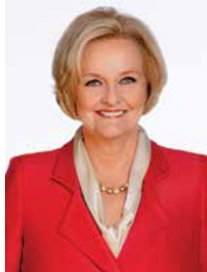
SEN. CLAIRE McCASKILL (D-MO)