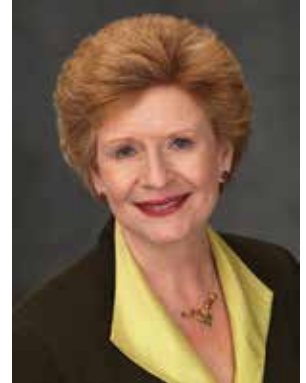
SEN. DEBBIE STABENOW (D-MI)