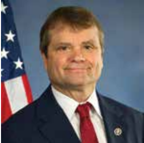
REP. MIKE QUIGLEY (D-IL/5)