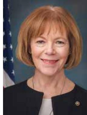
SEN. TINA SMITH (D-MN)