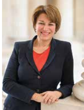
SEN. AMY KLOBUCHAR (D-MN)