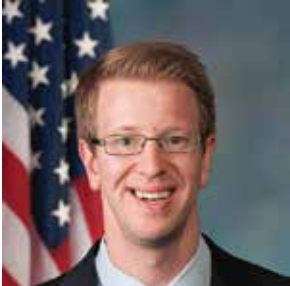
REP. DEREK KILMER (D-WA/6)