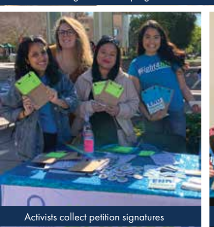
Phoenix #Fight4HER campaign kick-off event